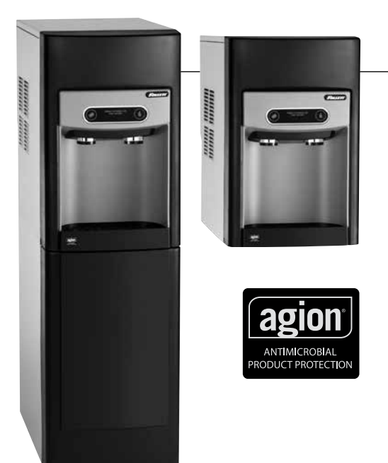
Shown with optional base stand

NOTE: For use in applications with greater than 5 mg/l but less than 400 mg/l total dissolved solids in water and less than 200 mg/l hardness (either naturally occurring or treated with reverse osmosis or other TDS reducing technology).