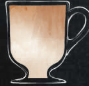
TAZO. CHAI LATTE