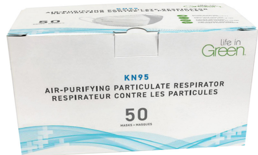
50 COUNT INNER BOX